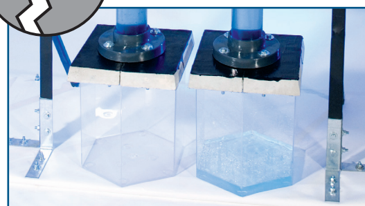
TUFF-N-DRI H8 No Leaks!

Membrane elongates to span a shrinkage crack, and effectively resists hydrostatic pressure.